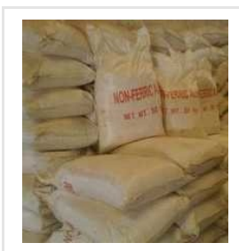
Non Ferric Alum