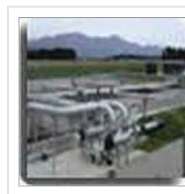
Effluent Treatment Chemicals