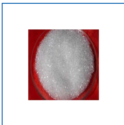
MAGNESIUM SULPHATE CRYSTALS