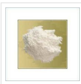
Poly Aluminium Chloride