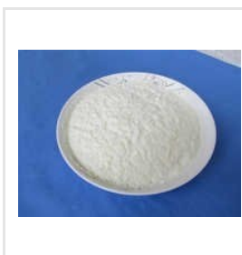
Poly Aluminium Chloride Powder