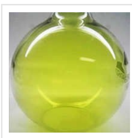
Sodium Hypo Chlorite