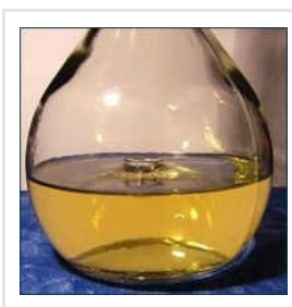
Turkey Red Oil