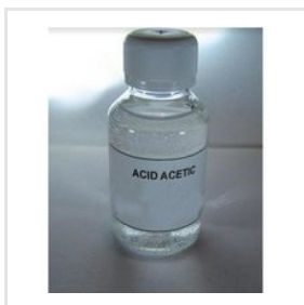
Acetic Acid Glacial