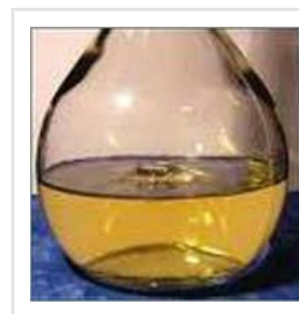
Turkey Red Oil 50%