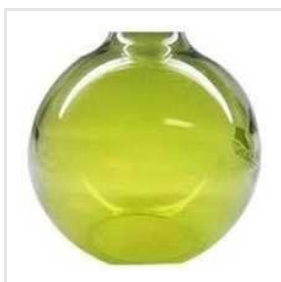
Poly Aluminium Chloride Liquid